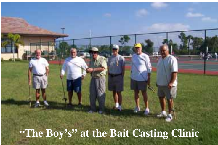
“The Boy’s” at the Bait Casting Clinic